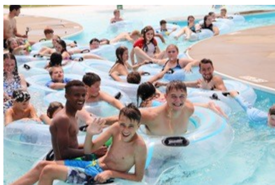
Skyview campers enjoy cooling off in the lazy river