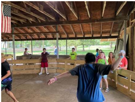
Upgraded maintenance area and Unplugged Arcade

We are also accepting applications for summer camp. Now is the time to reserve your spot for the best week of your summer! We have scholarship funds available for those that might need a little extra help. Contact the office today at info@CampPatmos.com for scholarship applications. Don't let finances keep your child from experiencing a week of camp at Camp Patmos.