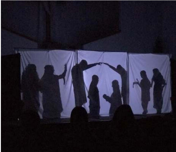
The student ministry at Shawnee Hills, Jamestown, presented the life of Jesus in a uniquely narrated presentation at the beginning of one of the Morning Worship services in December.