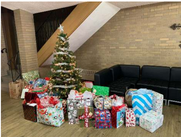
Grace Baptist Church, Westlake, collected 70 gifts for six different families in the Westlake community, demonstrating their desire to be known for loving and pointing their community towards Christ.