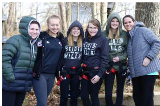
Winter Camp #1 2022

It is quite apparent, after speaking with other camp directors, that students, families and churches are determined to make a camp experience a priority in spite of COVID. 2022 event registrations prove it. We (camp directors) can testify that God proved Himself faithful during these crazy days. I have heard story after story declaring that God faithfully met the needs of our camps. All I can say is, "To God be the glory, great things He is doing!"