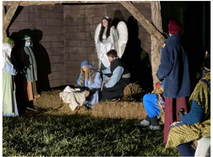
Albany Baptist Church, Albany, utilizes its ample parking lot and adjoining green space of the Albany Fair Board for an annual live drive-through depicting the life of Christ. It has become a tradition for many families in the community.