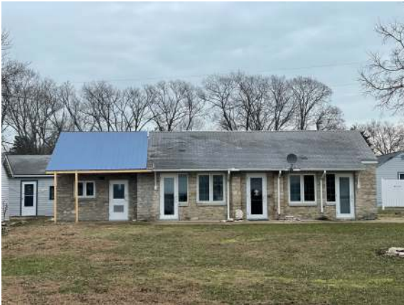
New metal roof over laundry room

Another year has passed, and another year has come to see what God will do at Camp Patmos. We are so thankful for our faithful friends and the support you give through prayer and sharing your time and treasure. We could not do it without you. I think back to the crew that came out this late fall replacing and installing the laundry room metal roof. We are also grateful to the many groups that came last spring and through the